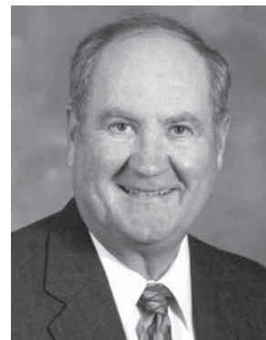
Howard Hawks Omaha