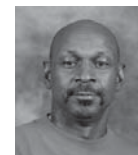
Sol Morton Building Services Technician