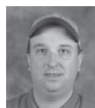
Norm Tallman Memorial Stadium Custodian